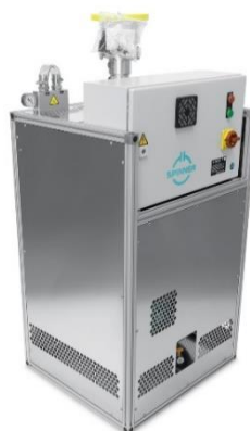
Indoor load unit