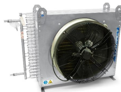
Outdoor heat exchanger