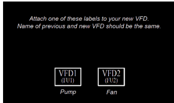
Reference designation labels

In this package, you will find the replacement frequency inverter and a separate set of reference designation labels. Please attach the corresponding label to the device as shown in this drawing. Make sure the new device gets the same name as the previous one. This allows for easier identification when referring to manuals, installation instructions, circuit diagrams, service notices or training videos.