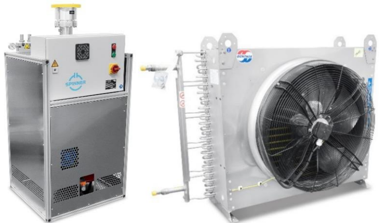
Indoor load unit