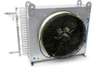
Outdoor heat exchanger