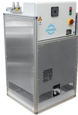
Indoor load unit